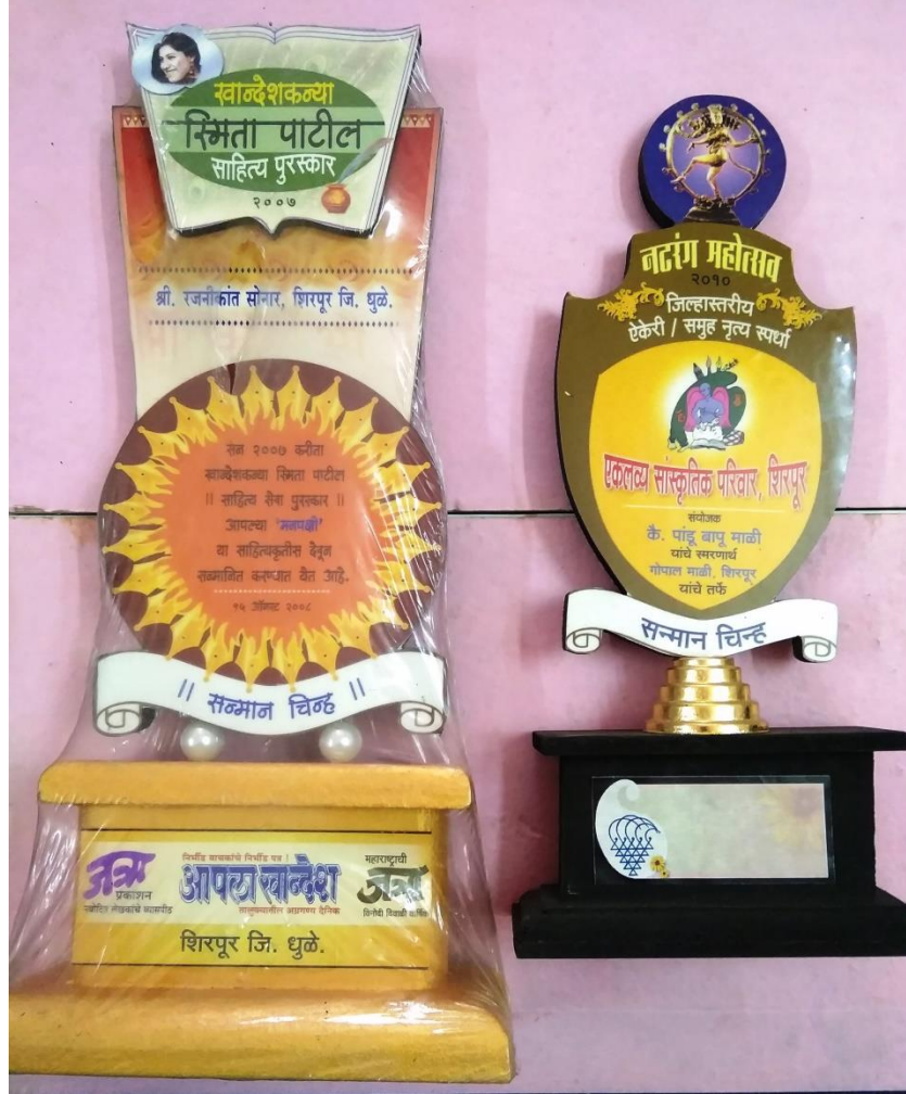
Smita Patil Sahitya Seva Puraskar 12 , September, 2009