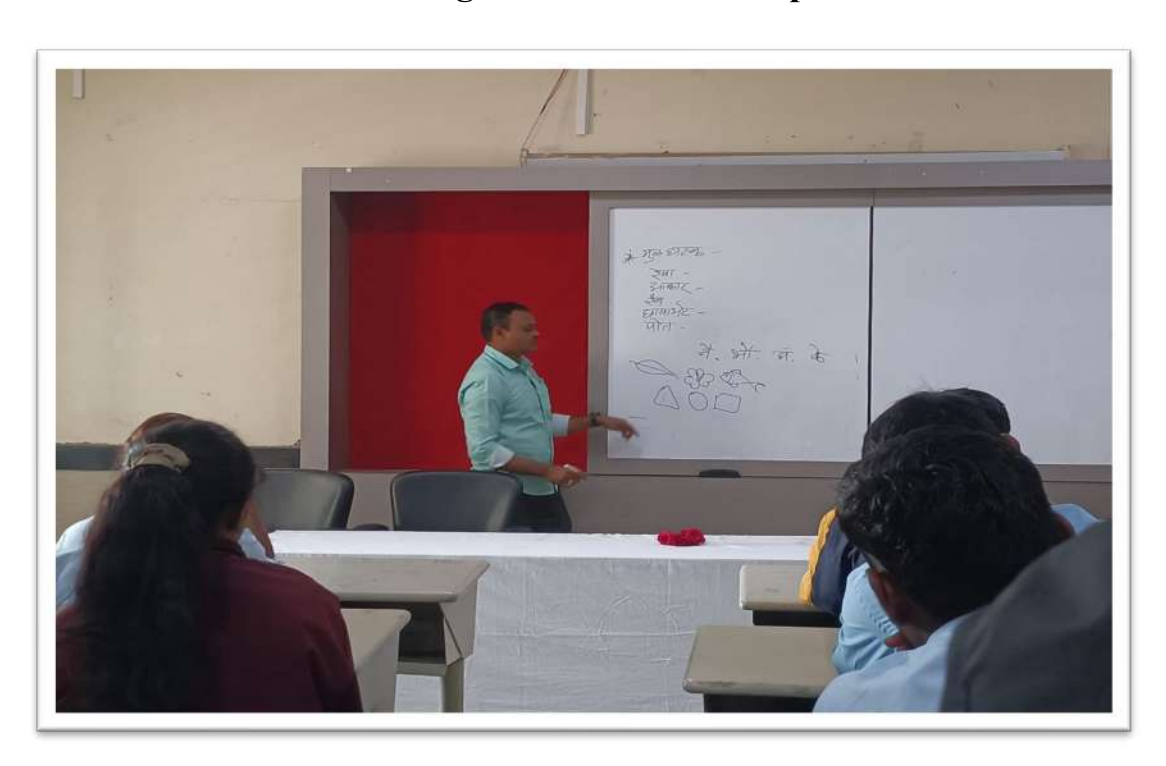
Resource Person Guiding the Participants