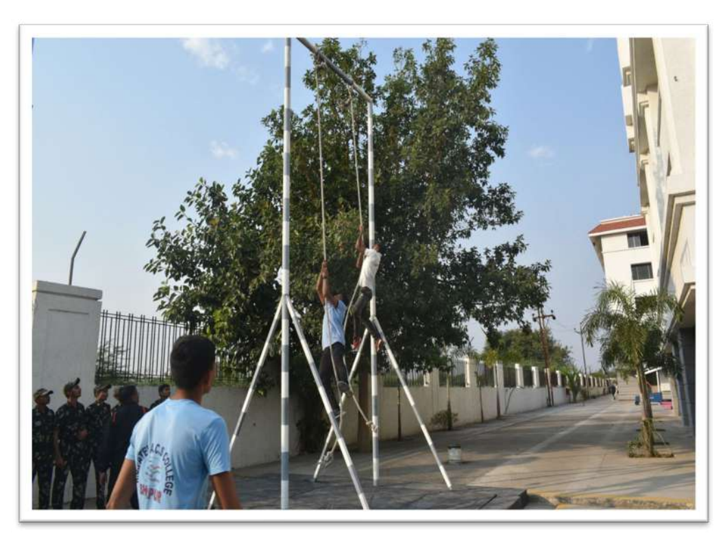
Training on obstacles and on field