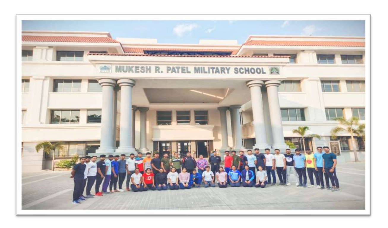
Field visit at M.R. Patel Military School, Shirpur