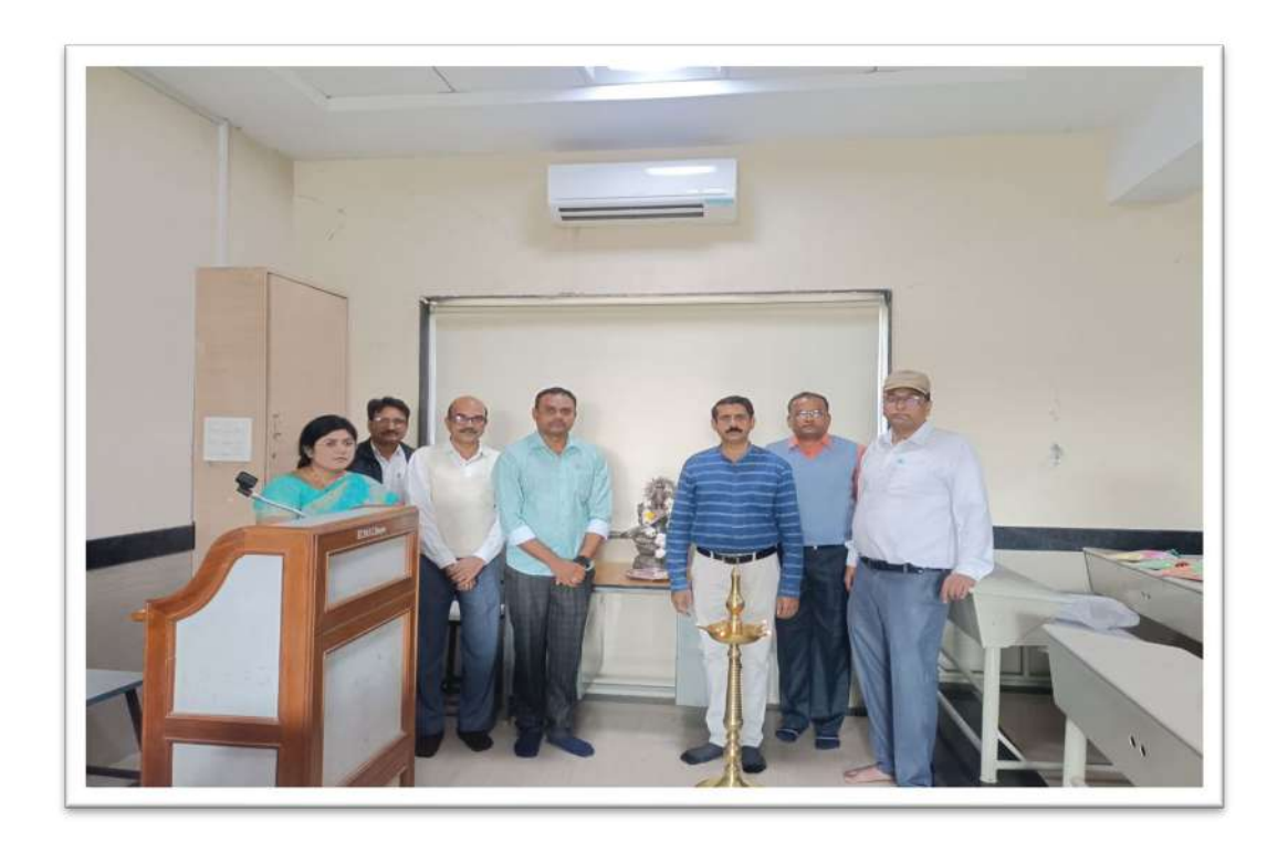
Inauguration of Workshop