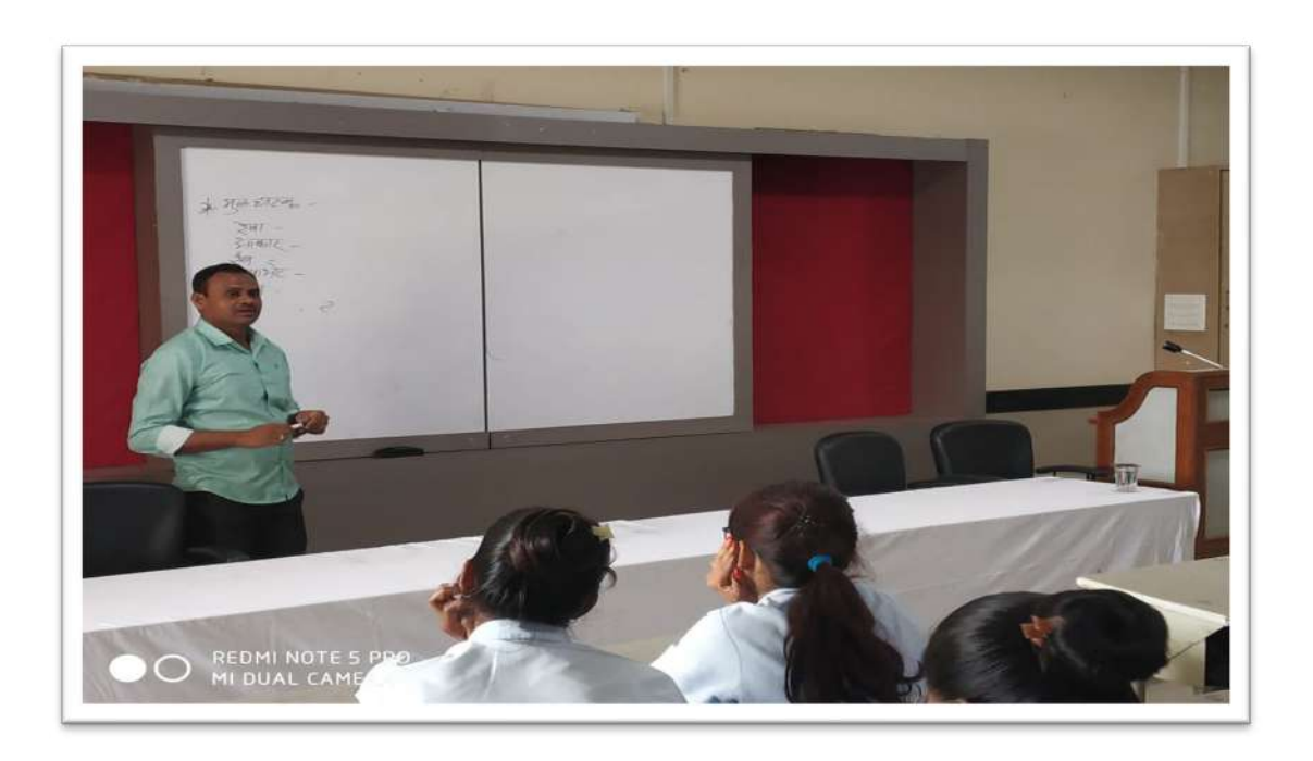
Guidance and practice