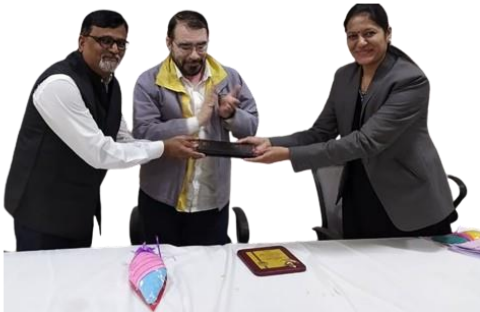
Head Department of Computer Science