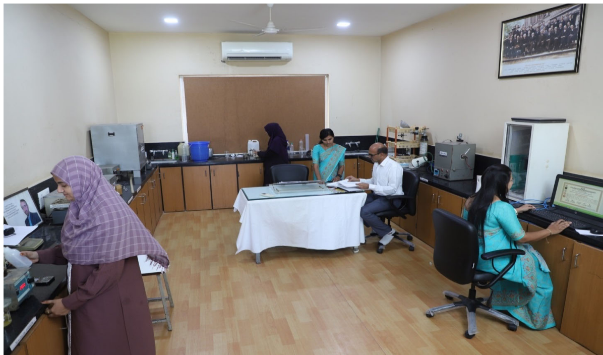
Research Lab: Physics