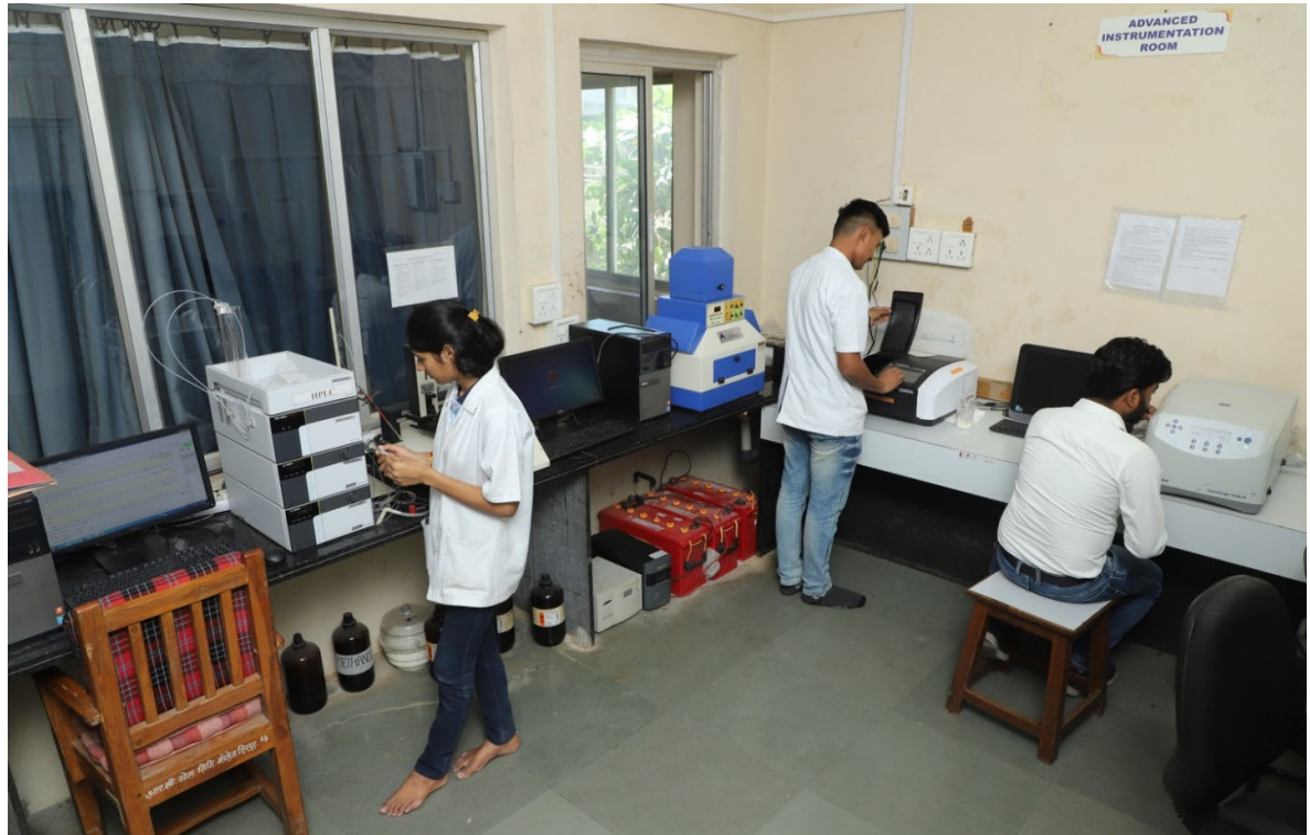
Research Lab: Microbiology & Biotechnology