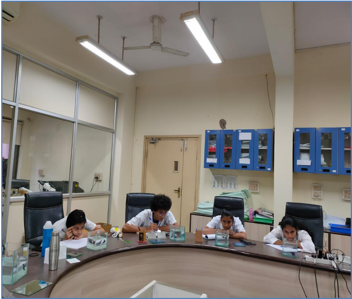
Team of RCPASC Students during Training session at HBCSE, Mumbai