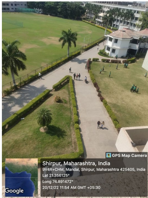
Figure 2: Green Campus of College