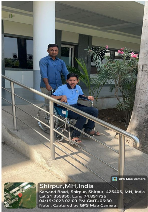
Figure 3 Facility for Divyanjan at College