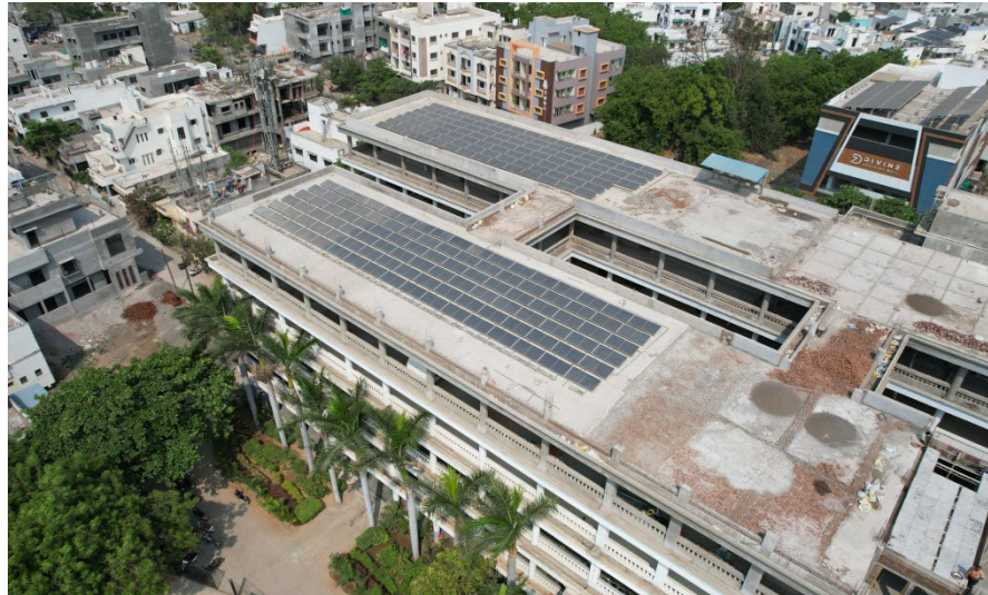
Figure 1: Solar Panel Installed at Roof of College Building