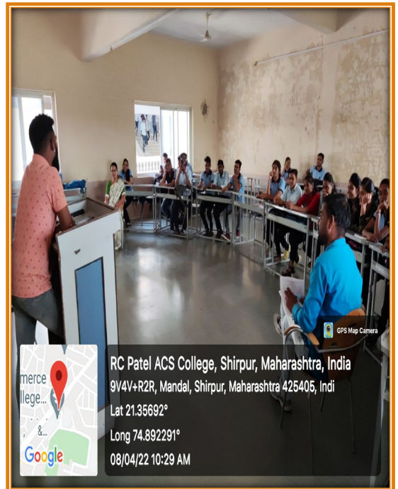
RC Patel ACS College, Shirpur, Maharashtra, India 9V4V+R2R, Mandal, Shirpur, Maharashtra 425405, Indi Lat 21.35692° Long 74.892291° 08/04/22 10:29 AM