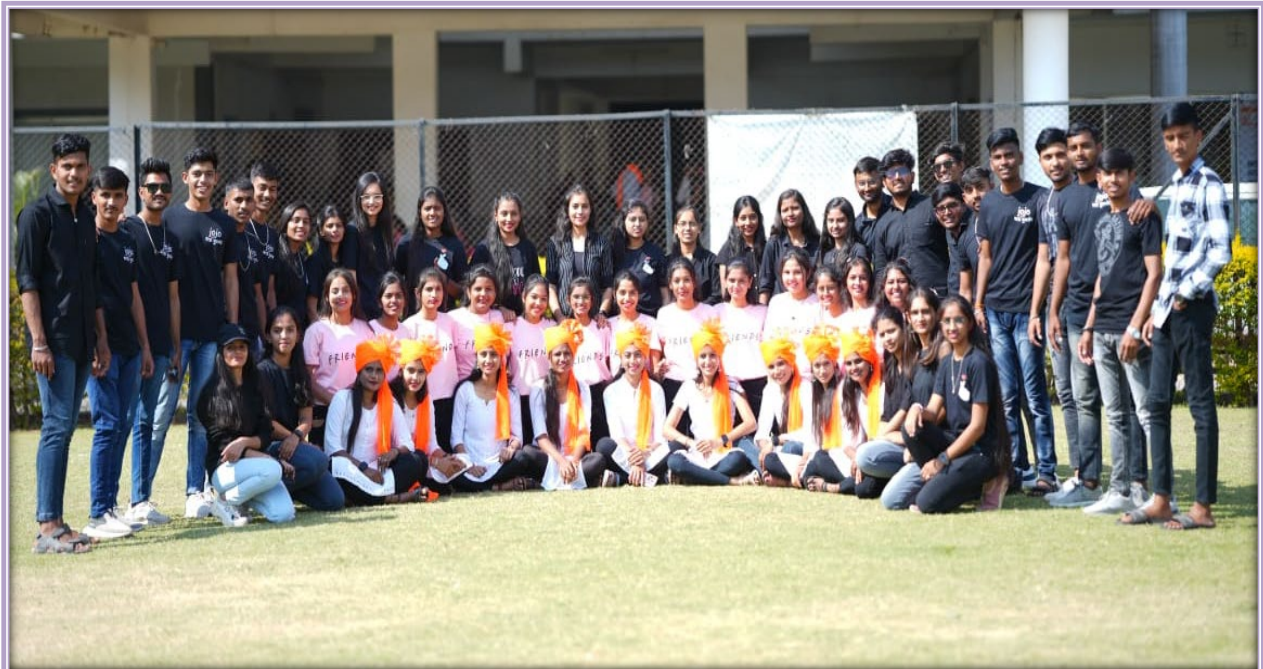
Winners of Youth Festival