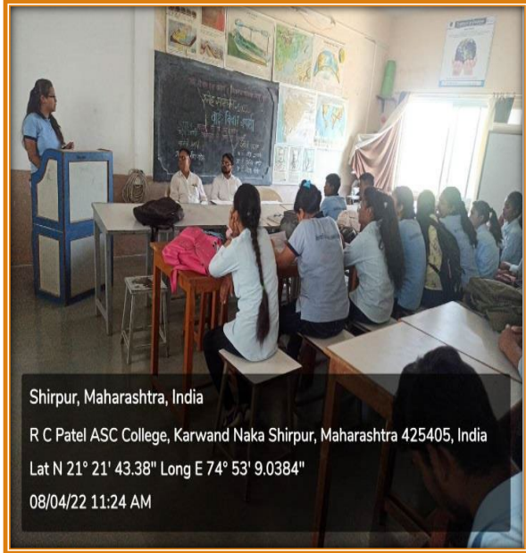
Shirpur, Maharashtra, India R C Patel ASC College, Karwand Naka Shirpur, Maharashtra 425405, India Lat N 21° 21' 43.38" Long E 74° 53' 9.0384" 08/04/22 11:24 AM