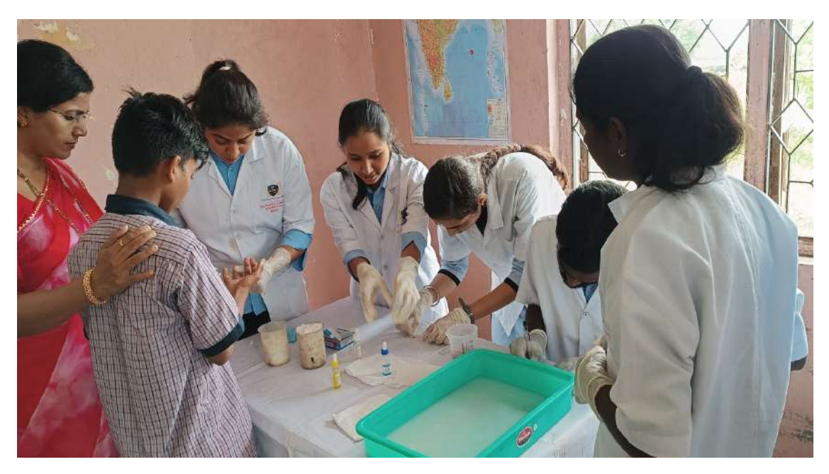
Blood group detection by Students of M. Sc.