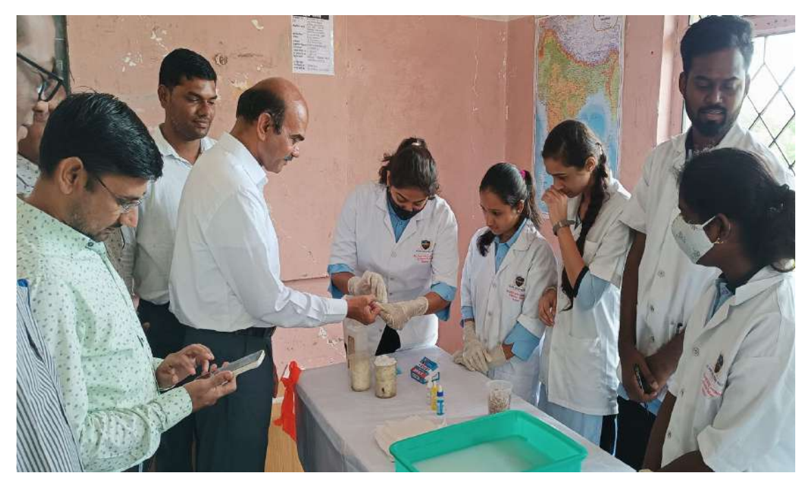
Hon'ble Vice Principal, R. C. Patel ACS College, Shirpur