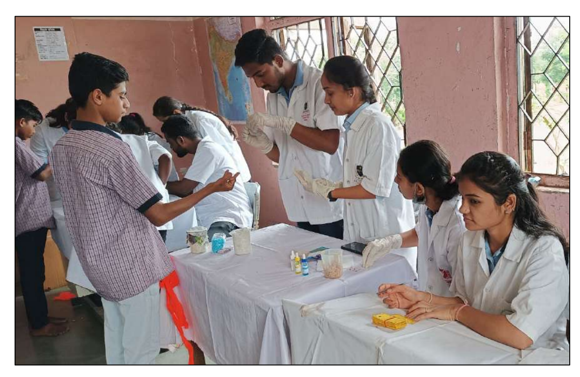
Blood group detection by Students of M. Sc.