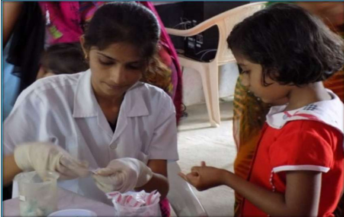
Student from M. Sc. pricking blood for Blood group detection