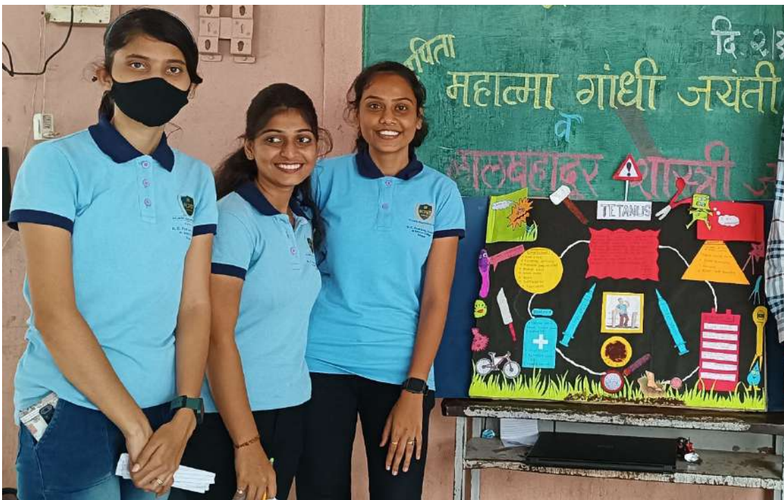
Poster presentation by the students of B. Sc.