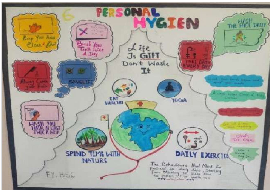
Poster prepared by student from F. Y. B. Sc