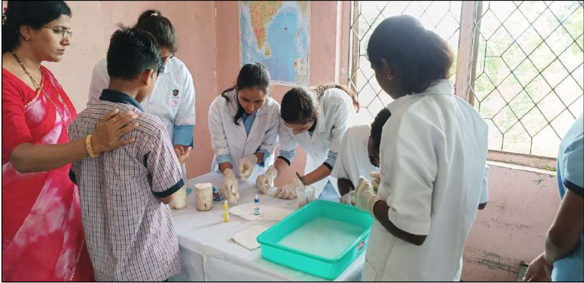
Students following Standard protocols while performing practice