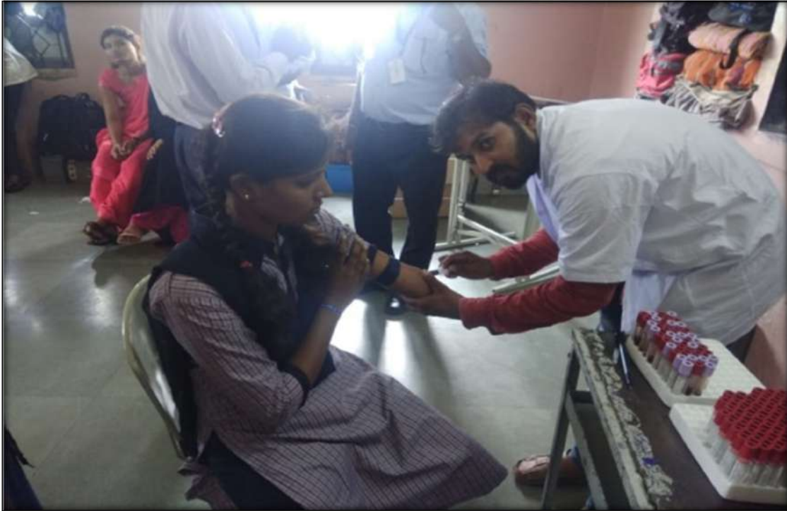
Student from M. Sc. pricking blood for pathological test