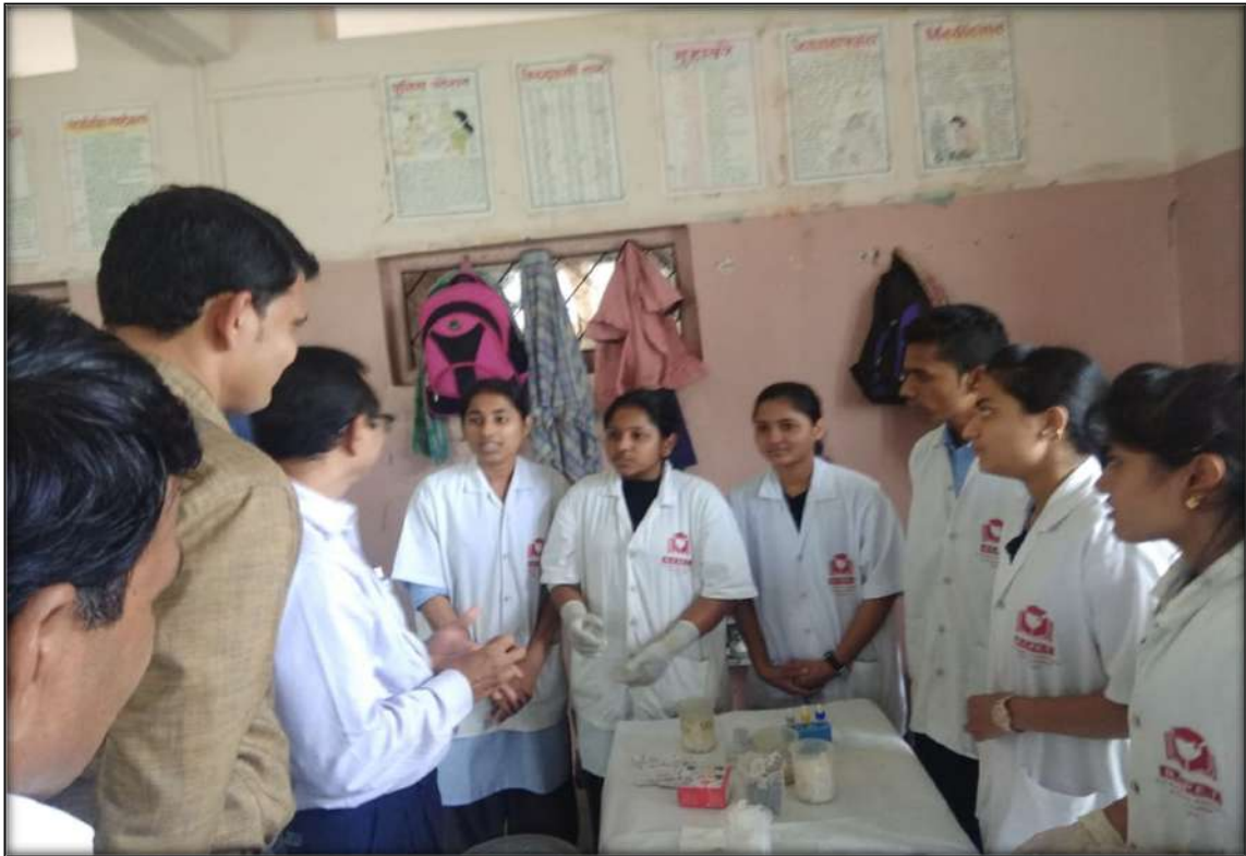
Health personal of Lauki village interacting with students of M. Sc.